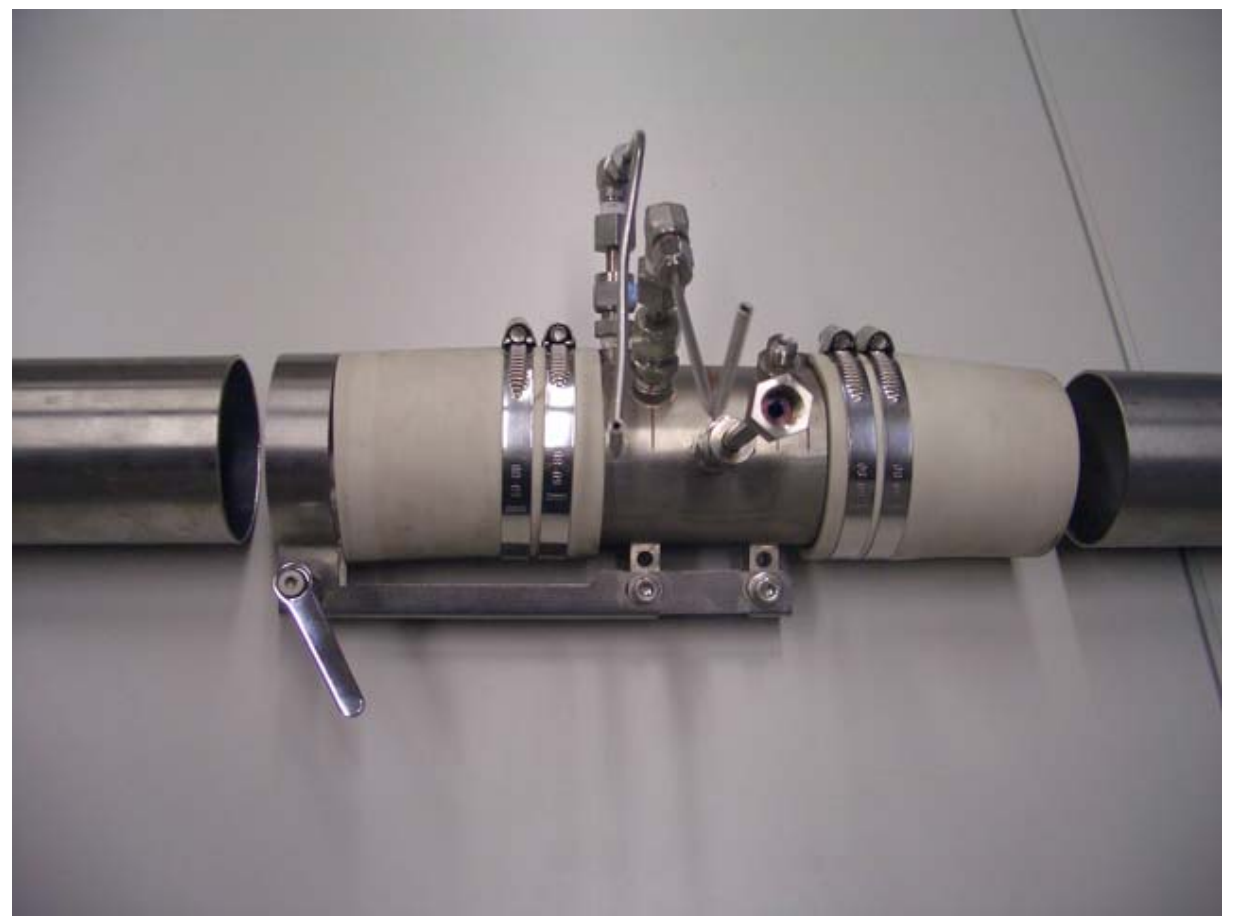
Illustration : OBS 2200 pitot exhaust flow meter, ready for installation in light aircraft (AS02, HB-HFX) for in-flight measurements (see Appendix 2).