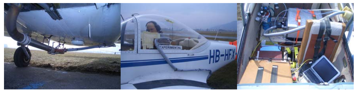
Exhaust flow meter, heated sampling line and installation on backseat of HB-HFX